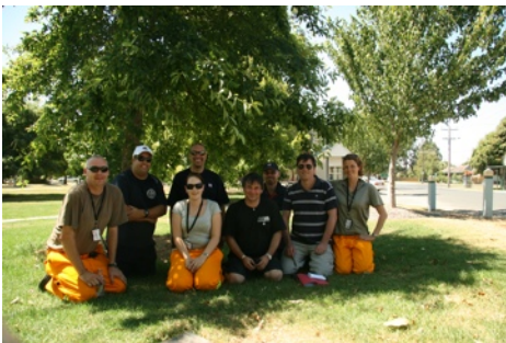
The Boolarra PIA team

There are several WMO enquiries and some queries springing specifically from the Black Saturday Fires, including around the hot topic of bunkers. Look out for this topic in next months MessageMatrix.